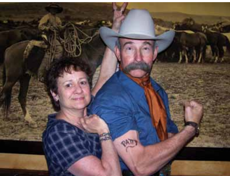
Patty with cowboy poet Baxter Black