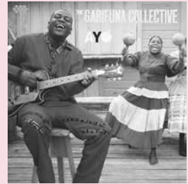
THE GARIFUNA COLLECTIVE Ayó Belize