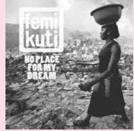
FEMI KUTI No Place For My Dream Nigeria