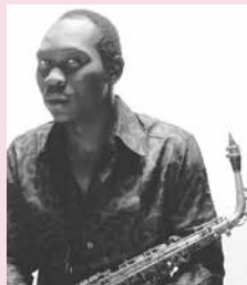
SEUN KUTI From Africa with Fury Nigeria