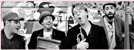
The California Honeydrops, appearing at the Strawberry Fall Music Festival.