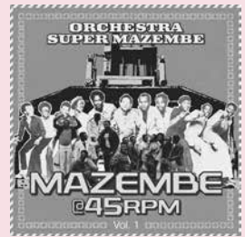
ORCHESTRA SUPER MAZEMBE Mazembe @ 45rpm Kenya