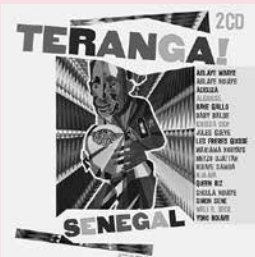
TERANGA Various Artists Senegal