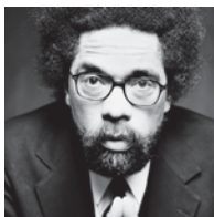
Dr. Cornel West

In their new book, The Rich and the Rest of Us: A Poverty Manifesto , award-winning broadcaster Tavis Smiley and Dr. Cornel West, one of the nation's leading public intellectuals, take on the "p" word – poverty. They challenge all Americans to re-examine their assumptions about poverty in America – what it really is and how to eradicate it.