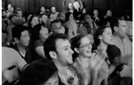
Showtime at the Swedish-American Hall in San Francisco.

Fresh from his new CNN series United Shades of America and his Showtime stand-up comedy special “Semi-Prominent Negro,” W. Kamau Bell is back in the Bay Area and ready for the live radio and social media event we call Kamau Right Now!