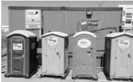
KALW’s current facade.

portables have gone from being a rough and ready place to make radio to just plain rough. The pavement is ripped up all around us. We’ve had to make special requests that the jackhammering stop during live shows like Your Call or Open Air . And the other morn-